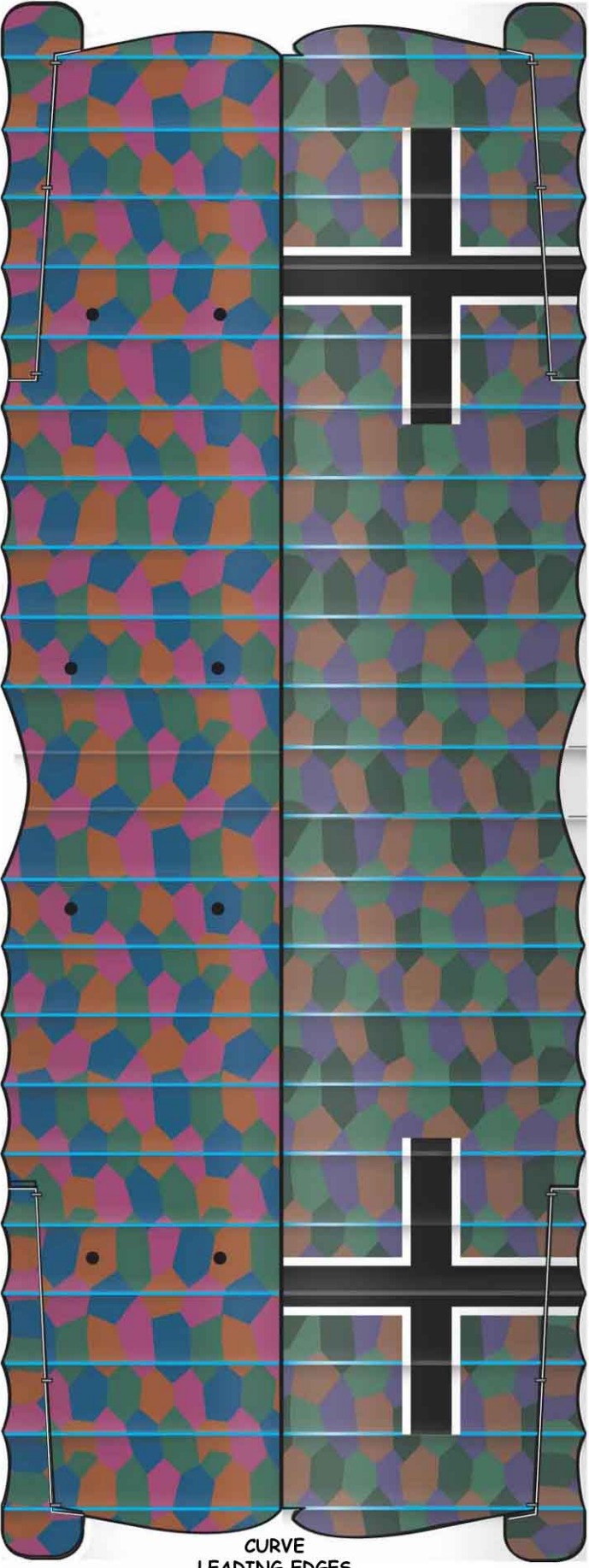
CURVE LEADING EDGES